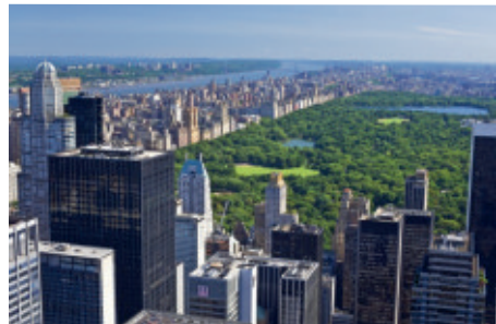
New York, Central Park South

The Gardens comprise an extensive park covering about 52 acres, originally established by the Brooklyn municipality, and opened in 1910. While maintaining an harmonious unity, the park is set out as a series of different gardens, each one characterized by a different stylistic,