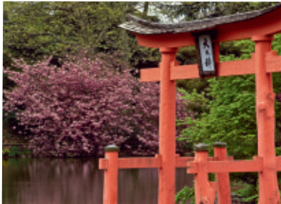
Brooklyn Botanic Garden, the torii

There have always been other, smaller green spaces in Manhattan, such as the collection of gardens of Bryant Park, the one next to the New York Public Library, Madison Square Park and Washington Square. There are also several mossy cemeteries flanking colonial-era churches and for more than a century swallowed up by high-rise Downtown and Midtown.