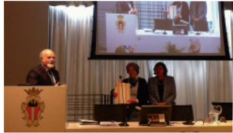
Antonio Ricci's speech to Gallesio Prize