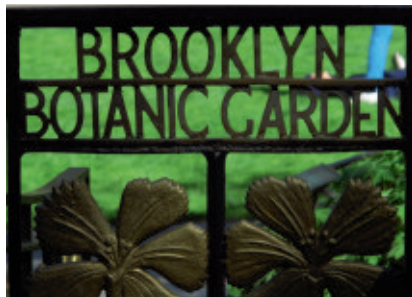
Brooklyn Botanic Gardens, the gate

After the cold wet winters of New England, towards the end of April the park reawakens and begins to attract numerous visitors at the time of the annual flowering of around 200 examples of cherry, celebrated by the hanami, the traditional Japanese festival which marks flowering, somewhat like the Cherry Blossom Festival in Washington. In fact the Brooklyn gardens have retained, unchanged, their special bond with Japanese botanic and horticultural culture. It is probably fair to say that the very heart of the park lies around the small garden and artificial lake