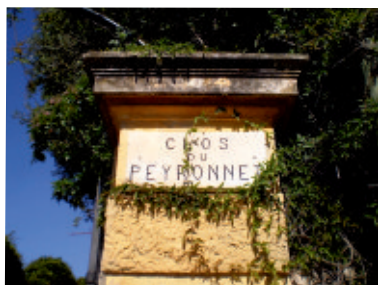
Clos du Peyronnet - entrance

Other striking parts of this garden are: the central feature of a water staircase consisting of five ponds falling away from consecutive terraces, a small orchard of exotic fruit trees including the rare "rose apple" or Jaboticaba, a clump of magnificent yellow bamboo and about 8 avocado trees of various varieties. The whole garden exudes harmony and creativity.