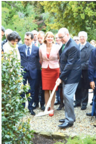
Albert II of Monaco planting a camellia in occasion of his visit in the Hanbury Garden