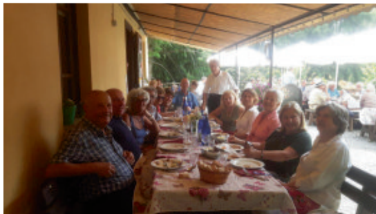
trip to Pollone