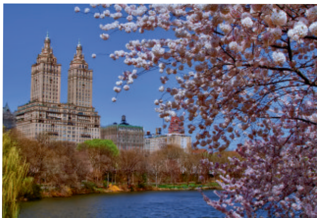
New York, Central Park, Cherry blossom

created by the landscape artist Takeo Shiota between 1914 and 1915. The garden in Brooklyn was the first public Japanese garden in North America, established around a small lake, on the edge of which was erected a large sacred Shinto shrine (tori), brought from Japan, and whose piles are sunk into the lakebed, as are those of the most famous tori in the whole of Japan, on