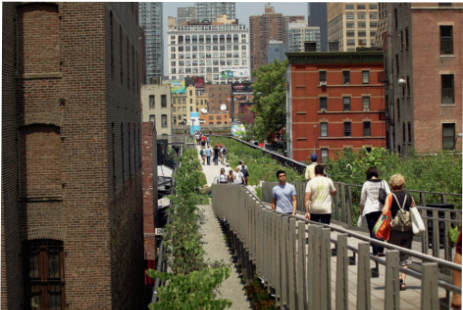
High Line, New York

If the trip to Brooklyn were not to entirely satisfy lovers of beautiful New York gardens, we would suggest a final visit to the northern most tip of Manhattan Island, to find Fort Tryon Park, with its wonderful mediaeval cloisters, bought in Europe by J. D. Rockefeller Jr., then taken apart and re-erected in this tranquil New York park, facing the calm waters of the Hudson River. A place of peace, silence and antique beauty. Entering the cloisters of the grand neo-mediaeval complex, one is momentarily disoriented, transported as if by magic from New York to the heart of Burgundy or Murcia.